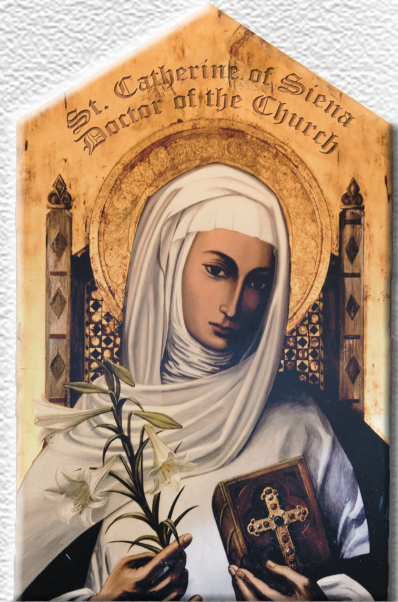
St. Catherine of Siena

neighbor, she strengthened peace and harmony, defended the rights and freedom of the pope, and promoted the renewal of religious life. She dedicated writings filled with sound doctrine and spiritual inspiration. Catherine was canonized in 1461. In 1970 she was declared one of the first women saints to be named a Doctor of the Church. *