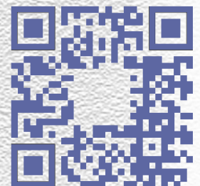
Readings in English