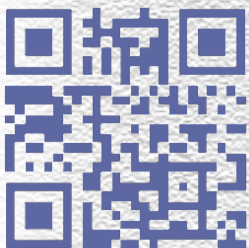
Readings in Spanish

Saturday: Acts 16:1-10/Ps 100:1b-2, 3, 5/Jn 15:18-21